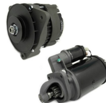
LucasElektrik marine range